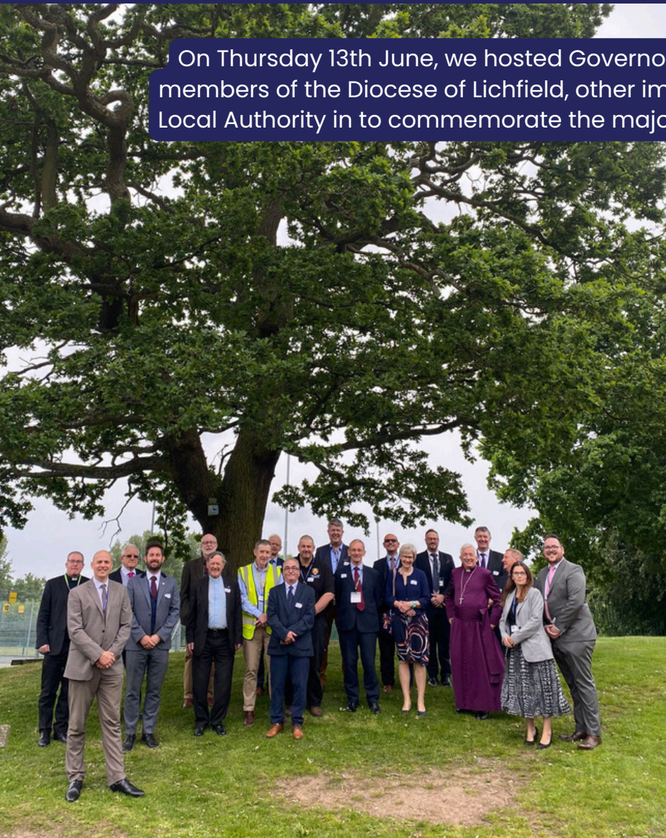
On Thursday 13th June, we hosted Governors, contractors, Trustees, members of the Diocese of Lichfield, other important stakeholders and Local Authority in to commemorate the major roof project completion!