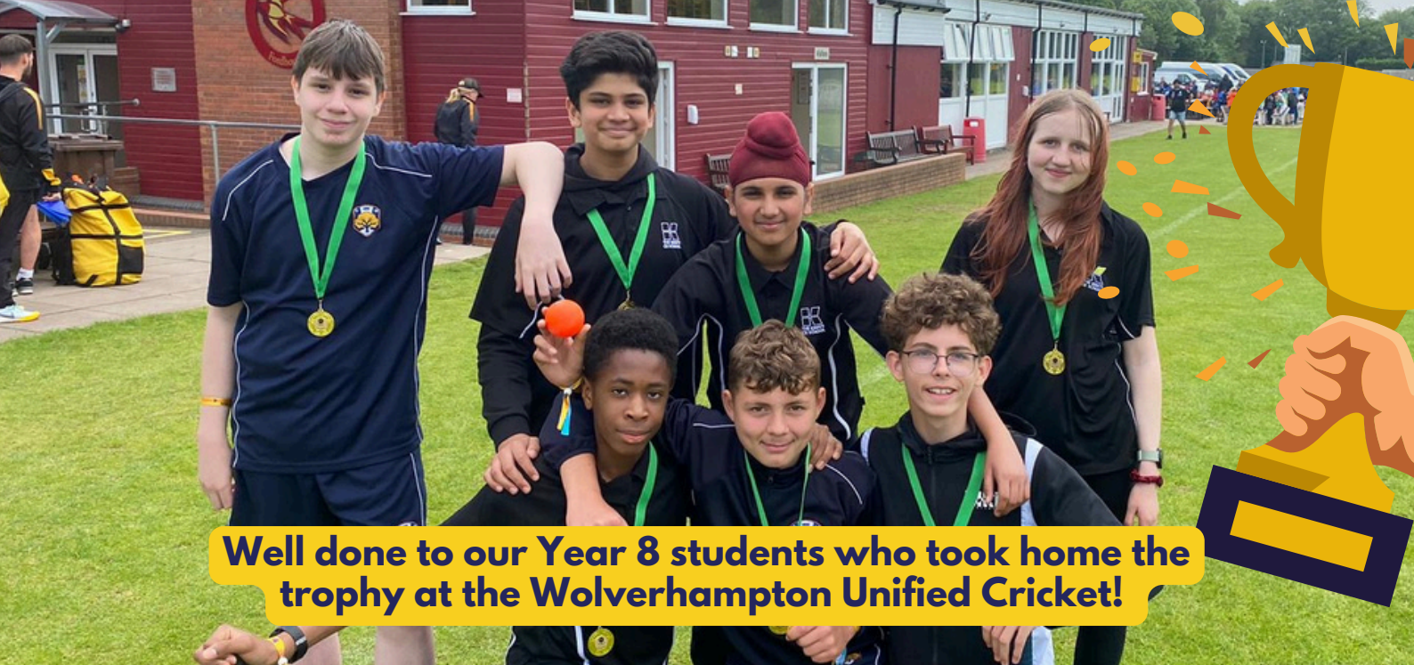
Well done to our Year 8 students who took home the trophy at the Wolverhampton Unified Cricket!