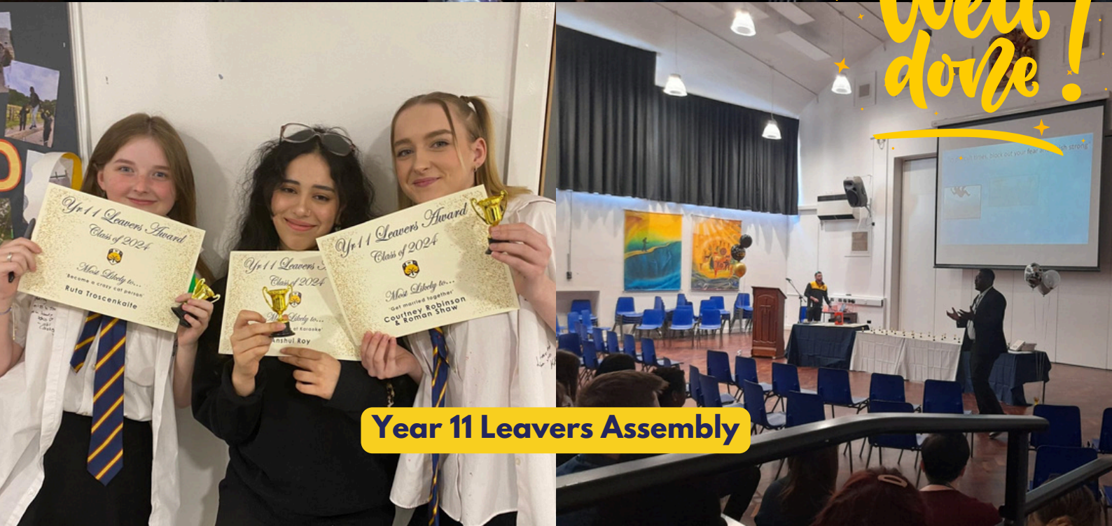
Year 11 Leavers Assembly